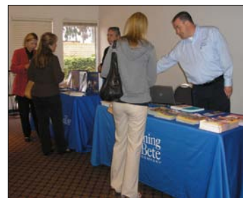
Counselors meeting vendors at the 2008 Community Resource Fair