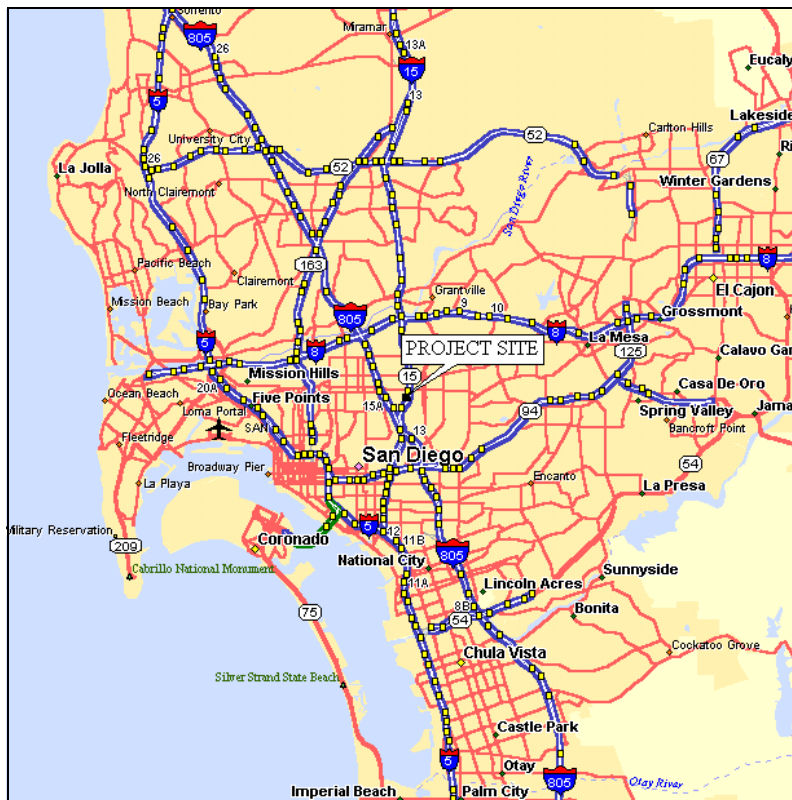
Figure 1: Regional Project Location

Central Area Elementary School will be constructed in the City Heights neighborhood of the City of San Diego. The City Heights community is located less than one mile from both Interstates 805 and 15 and, approximately, 5 miles northeast of downtown San Diego. (See Figures 1 and 2).