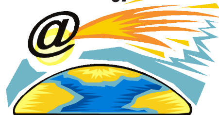
Cohort Online Masters in Educational Technology