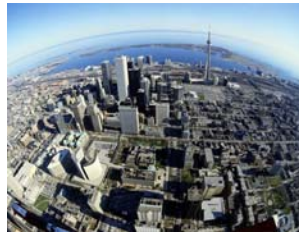
Toronto Skyline at Night