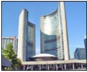
Toronto City Hall