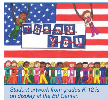
Student artwork from grades K-12 is on display at the Ed Center.

Veterans are encouraged to wear their uniforms on "Show Your Support Day," May 22. Also that day, winners of the student art contest will be announced at the Board of Education meeting. Employees who didn't serve in the military, along with students, are encouraged to wear patriotic colors that day.