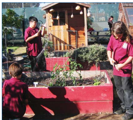
Roosevelt Middle School students maintain a garden box in the Roosevelt Schoolyard Garden.