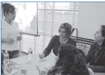
Monthly learning academies give teachers a forum for networking with other beginning teachers and a place to share their successes and challenges.

The Beginning Teacher Support and Assessment (BTSA) Induction Program provides new teachers with a high level of emotional support and a common framework for discussing teaching. This year, BTSA is helping 234 first-year teachers and 211 second-year teachers work through state requirements for their professional clear credential.