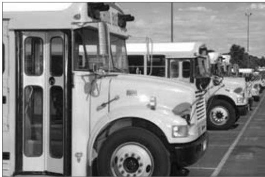
Becoming America’s Best from Pg 1

are only used by special education students and those whose parents have exercised a school-choice option. All drivers are trained on the needs of special education students.