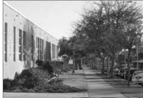
The efforts by the grounds crew at Edison Elementary School this year have had positive effects even beyond the schoolyard.