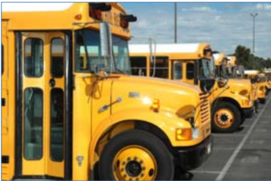
Becoming America’s Best from Pg 1

are only used by special education students and those whose parents have exercised a school-choice option. All drivers are trained on the needs of special education students.