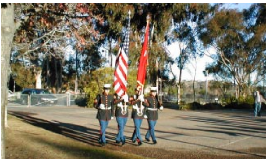
A TRIBUTE TO PATRIOTISM - The color guard from the Inspector Instructor Staff San Diego and personnel from Marine Corps Air Station Miramar participated in a special patriotic assembly at Miramar Ranch Elementary. The school holds regular flag assemblies which include a "character building" theme. This twist included singing of the national anthem and releasing red, white and blue balloons.