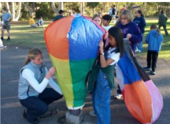
UP, UP AND AWAY! Students and staff at Miramar Ranch Elementary recently held their annual Hot Air Balloon Festival. Students created balloons out of paper and other materials, and parents helped with launching.