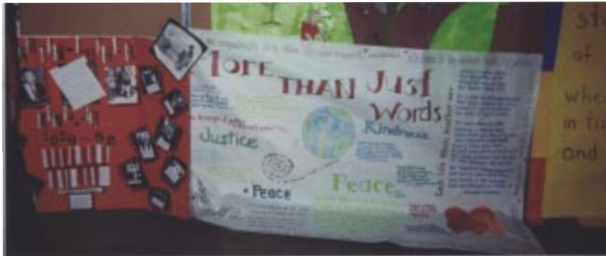
A WALL OF PEACE, KINDNESS AND JUSTICE was created by Serra High School students as part of the Kindness and Justice Challenge in honor of Dr. Martin Luther King, Jr. More than 100 students helped create 21 different panels depicting the civil rights leader's ideals such as tolerance. The idea came from a letter by Martin Luther King III in an Ann Landers column.