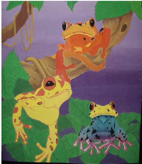
Monica Morales, Gr. 10, San Diego High School

San Diego City Schools is home to some of the best arts teachers in the state. In fact, two of our teachers have recently been so honored ( please see People & Places column ). With the leadership and support of the district's Visual and Performing Arts (VAPA) program, our teachers have implemented creative and quality arts instruction.