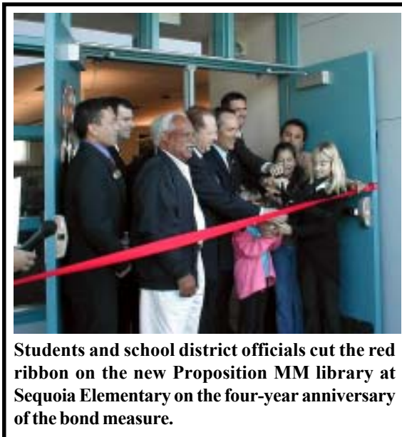
Students and school district officials cut the red ribbon on the new Proposition MM library at Sequoia Elementary on the four-year anniversary of the bond measure.

Prop. MM sought to fund major repairs and renovation at 165 existing schools, construction of 16 new or rebuilt schools, 160 new classrooms, 104 new libraries, 40 new science buildings, 84 new instructional support rooms, classroom technology, new